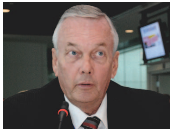
Prince William County, VA Chief Charlie Deane

A few months later, the Task Force implemented a major media campaign that included a website and digital billboards along Interstate 95 from Maine to North Carolina. As a result, detectives finally received a tip regarding someone in New Haven. As it turned out, the identified suspect was one of the 14 people of interest on the short list. With that information, a team of detectives was sent to New Haven to try to surreptitiously obtain the suspect’s DNA. As a result of the intense publicity, the suspect was very careful about being seen in public. However, detectives learned he had a scheduled court appearance for a minor charge in New Haven. They monitored that appearance and collected a cigarette butt that they watched him discard