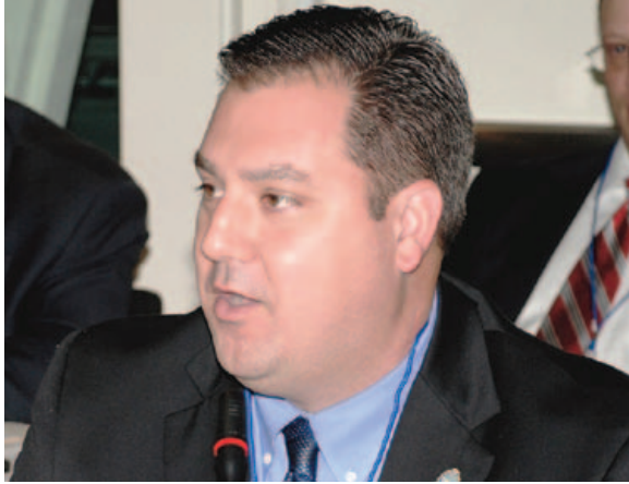
New Orleans Police Commander Paul Noel