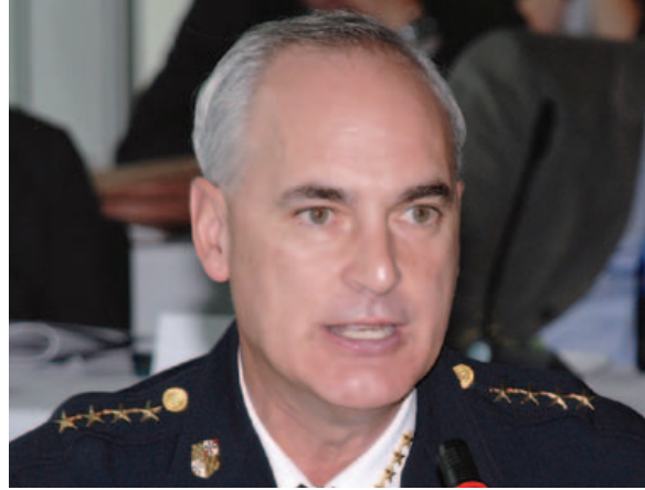
Baltimore Police Commissioner Fred Bealefeld

When a case is unfounded, a determination has been made that a rape did not occur. Unfounded cases also don't go into a department's UCR statistics. We pulled 150 closed cases from 2009 that had been classified as unfounded, and our audit found that over half of those cases were misclassified and should have been open investigations.