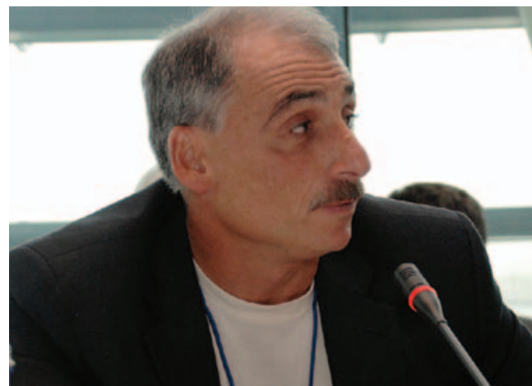
Daytona Beach Police Chief Michael Chitwood

There are a few states using familial DNA testing and it's currently used in the United Kingdom. I think we need to take full advantage of the science that we have at our disposal. If familial DNA can help us solve a rape or murder case promptly,